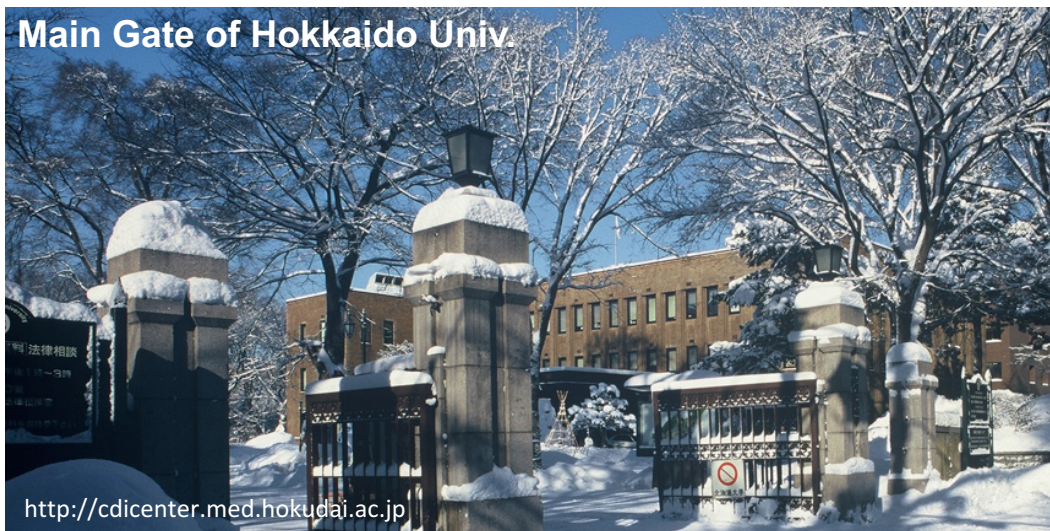
Main Gate of Hokkaido Univ.